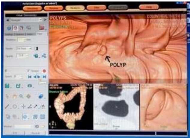
The Colon Health Center of Delaware offers noninvasive virtual colonoscopies. If a polyp is found during the screening, the patient is sent to Mid-Atlantic GI Consultants, about a half-mile away, for a traditional colonoscopy.