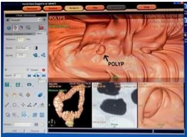
The Colon Health Center of Delaware offers noninvasive virtual colonoscopies. If a polyp is found during the screening, the patient is sent to Mid-Atlantic GI Consultants, about a half-mile away, for a traditional colonoscopy.